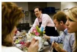
BUY THIS PHOTO »